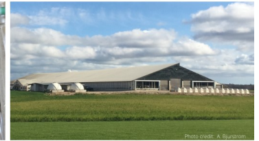
2.16.22 | 1:30-3:30 pm groundwater