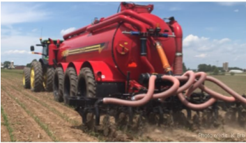
2.15.22 | 9:30-11:30 am nutrient management

hosted by UW-Madison Division of Extension in collaboration with WI Department of Natural Resources