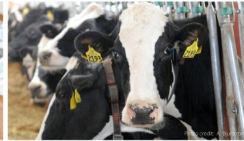
2.16.22 | 9:30-11:30 am regulatory updates