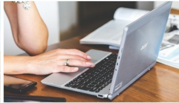
2.15.22 | 1:30-3:30 pm engineering