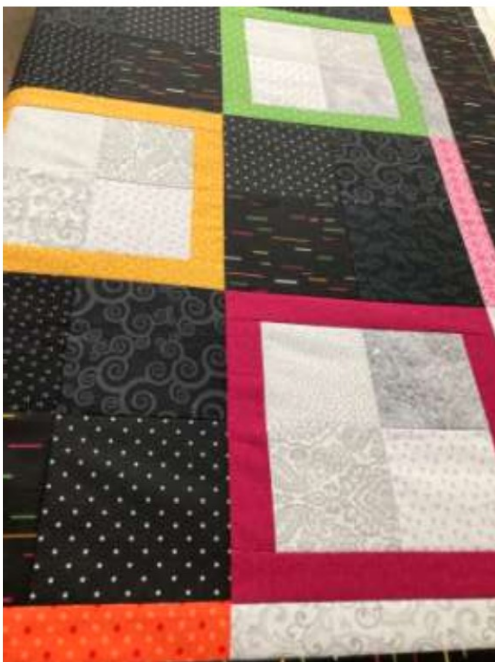
The completed quilt contains 17 black blocks and 18 white blocks plus borders.

Featured Quilt: Hopscotch Finished size 48"x64" Who: Youth in 6 th grade and up Where: Hewitt Village Hall 7688 McLean Dr Hewitt, WI When: Monday, May 15 5:00-7:00PM at JOANN's in Marshfield . Guild members will be available to help select fabrics. Monday, June 19 - Friday June 23, 9:00AM-3:00PM Cutting and sewing top together Tuesday, August 1 9:00AM-noon Work on binding What: All participants will be making a Hopscotch throw-sized quilt.