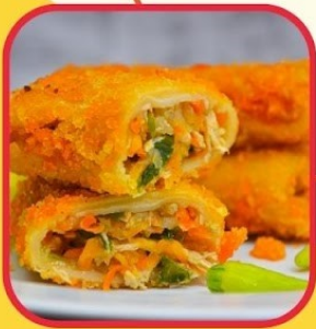
Cena Ligera Light Dinner