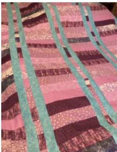
The completed throw contains 30 strips down and 4 columns across plus borders. The completed quilt contains 42 strips down and 5 columns across plus borders.

Sponsored by Piecemakers Quilt Guild in conjunction with UW Cooperative Extension